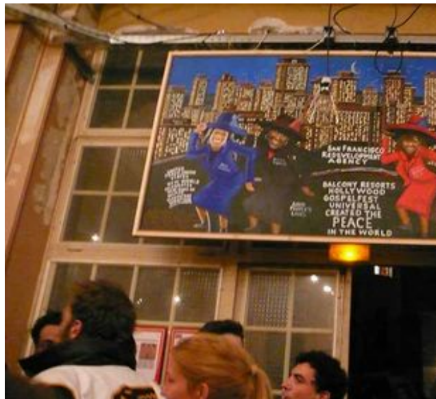
Before I realised that you could not take photos, I had already snapped off a few.