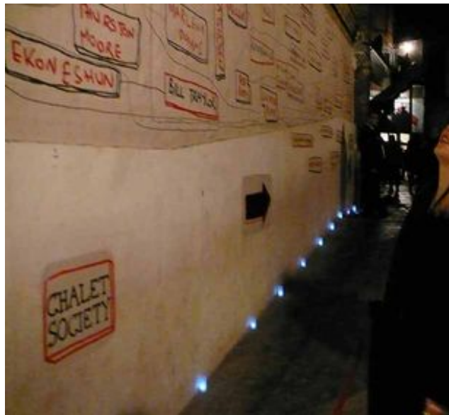
Belmacz's Julia at the entrance of the Museum of Everything