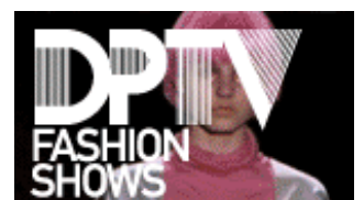
Video: DPTV Report: Fashion Shows