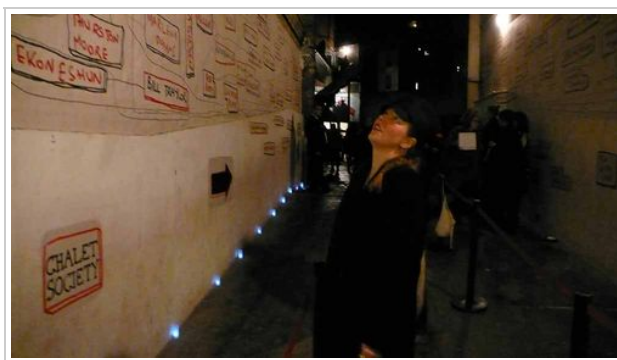
Belmacz's Julia at the entrance of the Museum of Everything

Posted in: JCagain, News | By Author | October 18, 2012 | 0 Comment