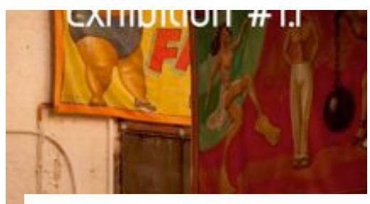
↓ Exhibition #1.1 @ Chalet Society – Paris

by Don Tercio on 24/10/2012 • Leave a comment