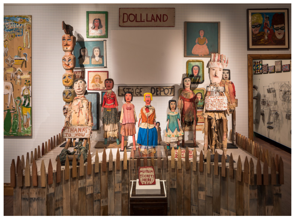
Untitled (all), Calvin and Ruby Black, 1955–1972, Courtesy of The Museum of Everything. CC BY

disruptive, so fresh and confronting that it commands our attention.