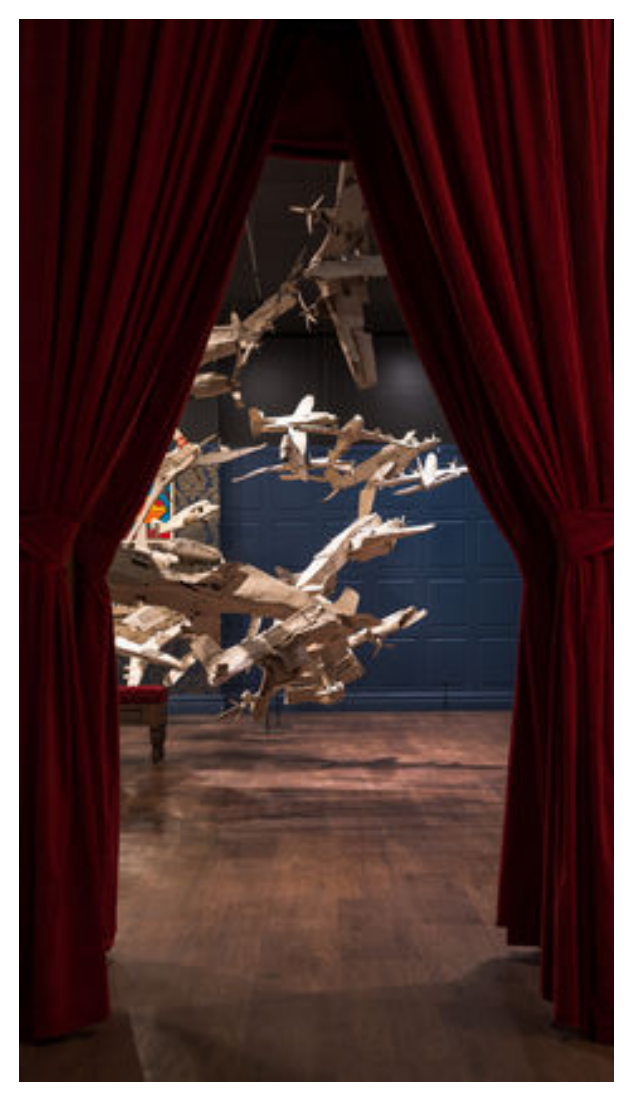
Untitled (all), Hans-Jörg Georgi, 2010–15, Courtesy of The Museum of Everything. Moorilla Gallery, CC BY

Which brings us back to those big questions: is it art, and should we be viewing it? Perhaps the best way to describe the individuals whose works fill the Museum of Everything is that they separately and as a group pose questions about the nature of art and challenge us to ponder what it means to be an artist. Significantly, through this process, they highlight the sense of our own humanity and showcase the qualities we ascribe to humanness. What could be more rewarding, inspiring and affirming?