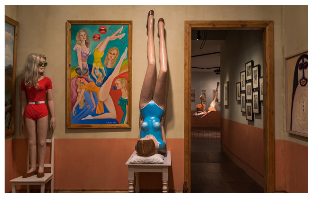
Untitled (all), Bogdan Zietek, 1970–2010, Courtesy of The Museum of Everything. Moorilla Gallery, CC BY

Can we even call what they make "art", in the way we conventionally define it, if there is no intention to communicate with an audience?