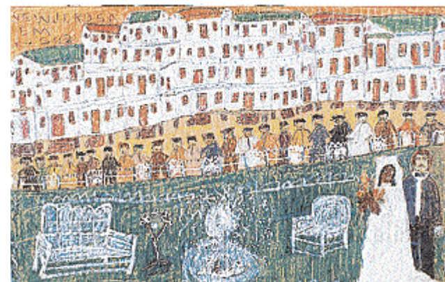
OH HAPPY DAY: A painting by Sister Gertrude Morgan

"My first encounter with 'outsider art' was in the southern states of America where 50 per cent of the artists are African American. Their work was mainly labelled folk, they weren't being celebrated and